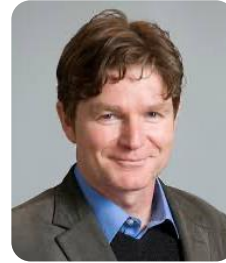
John F. Kelly